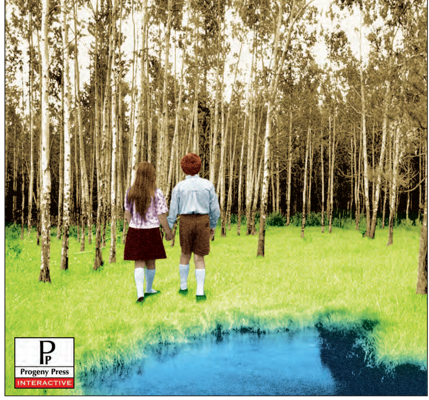
#314 Grades 5-7 Reproducible Pages